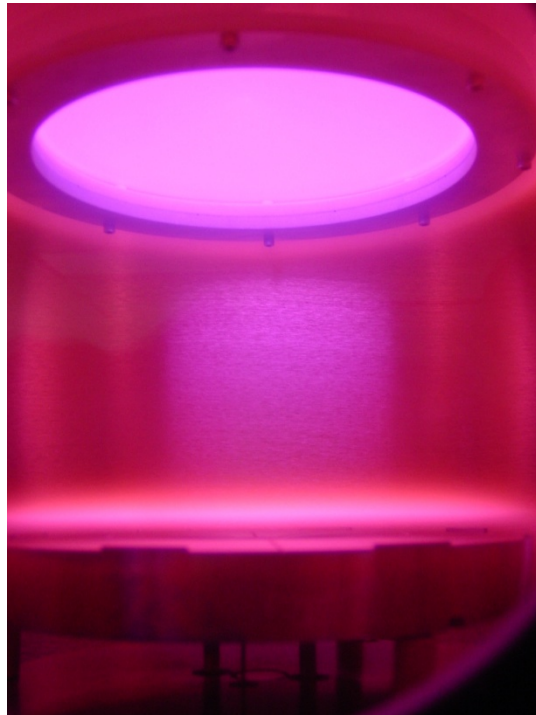
Plasma Source with Shower Head Distribution